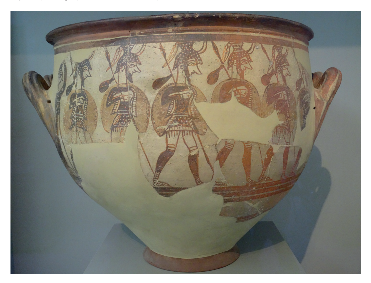
The Warrior Vase from Mycenae

1 Study the photograph and answer the questions.