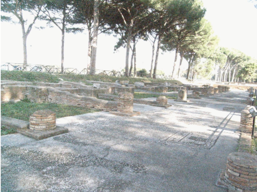
Piazza of the Corporations, Ostia

2 Study the following photograph and answer the questions.