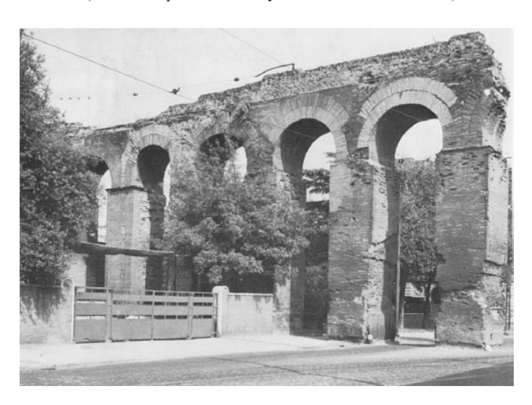
Photograph C Part of the Aqua Julia on the Esquiline Hill in Rome

(a) Photographs B and C illustrate two different circumstances in which the Romans used arches to support an aqueduct. Explain why the Romans used arches in these two circumstances.