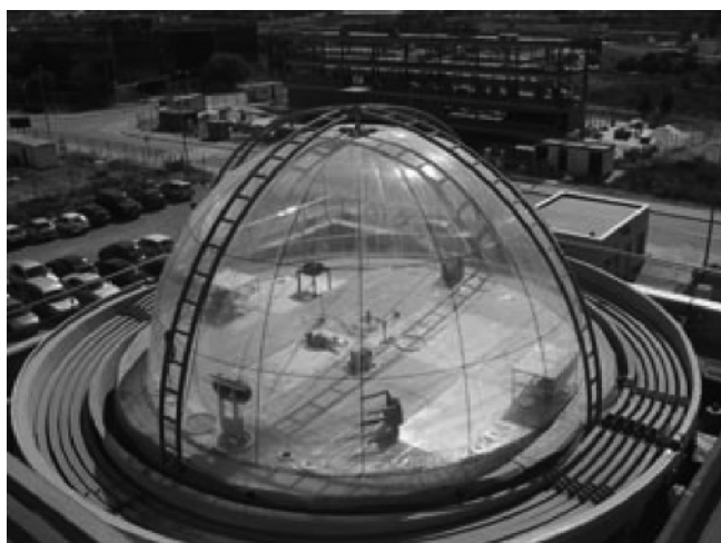
A 'smog chamber' at the European Photoreactor (EUPHORE) in Valencia, Spain

Our understanding of atmospheric chemistry has been developed through a combination of laboratory studies, field measurements and computer modelling. Laboratory experiments are used to determine the molecular properties (reaction rate constants and photolysis rates) governing the fate of individual atmospheric species. The results are used to design reaction mechanisms for specific species, which are then used in computer models of atmospheric chemistry. Comparisons of such models with field measurements of concentrations in the ambient atmosphere are then used to test the model, and refine the reaction mechanism as necessary.