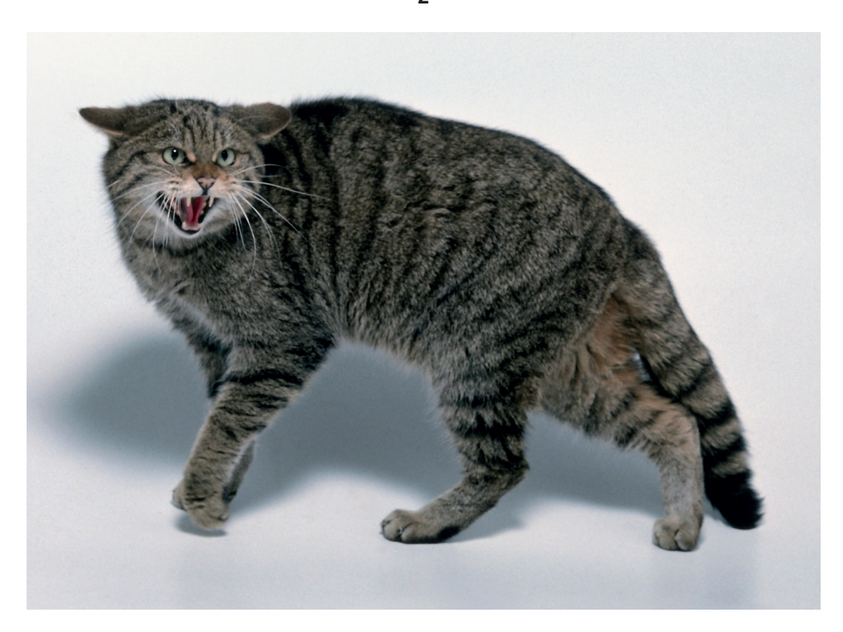
Fig. 1.1 Scottish wildcat