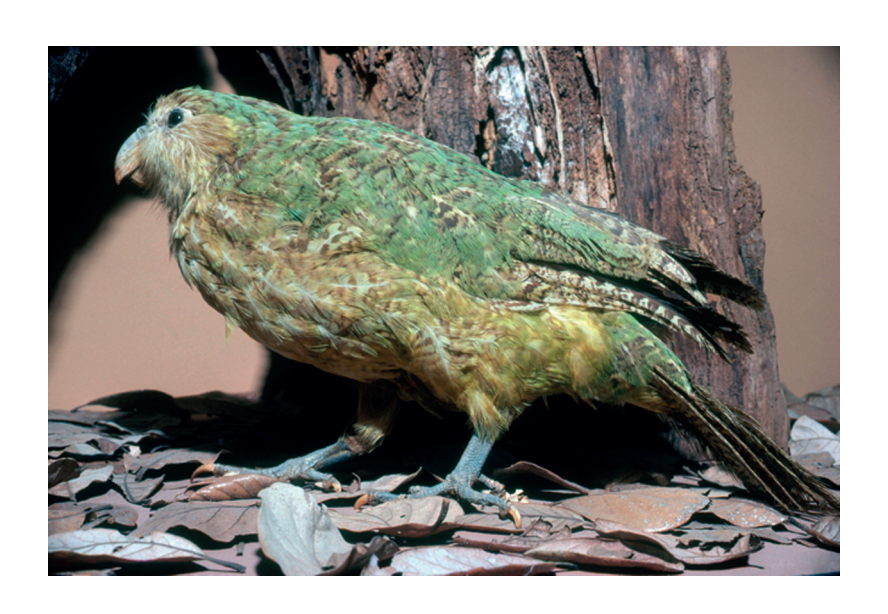
kakapo (Strigops habroptila)