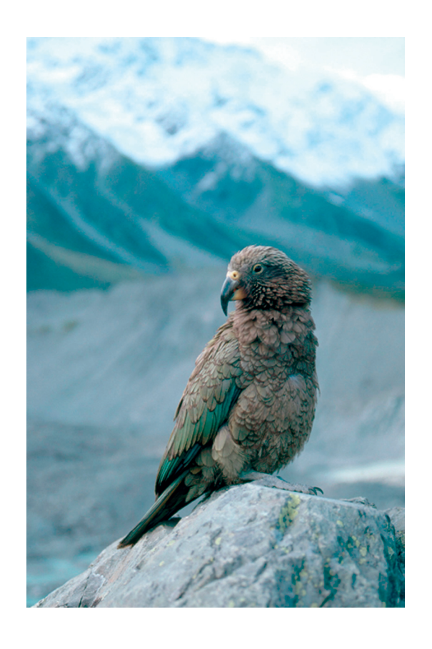
kea (Nestor notabilis)