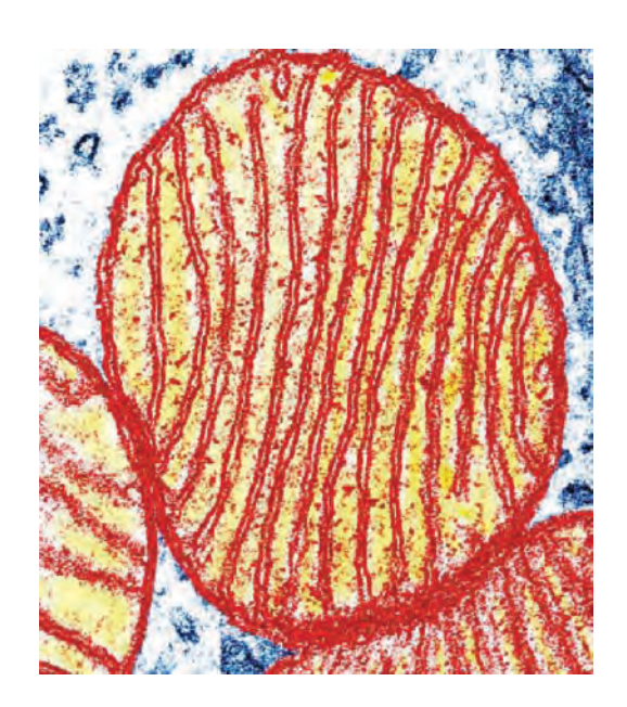
Genes in the nucleus that encode proteins for the mitochondria (above) could underpin diseases.

3. Mitochondria store the energy released from food in the form of a molecule called ATP, which is used to power virtually all forms of work in the body, from muscle contraction to protein synthesis. Your body's mitochondria generate an impressive total of some 65 kg of ATP every day. The double-membraned organelles perform this feat thanks to a process called chemiosmosis, which pumps protons across one of their membranes. ATP is generated when the current of electrically charged protons, produced by this pump, passes through tiny protein motors embedded in the same membrane.