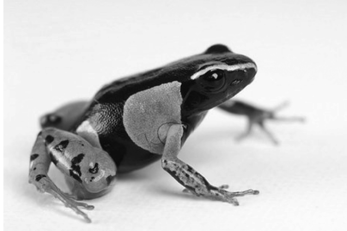
Magnification \times 2

Plan an investigation to compare the antibiotic properties of the secretions from two different species of Mantella frog.