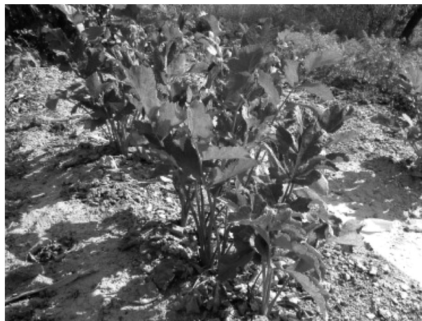
Magnification \times 0.2

If the seeds are sown too far apart, few will grow into adult plants and the crop will be poor. If they are sown too close together, few plants will emerge from the soil and the crop again is poor.