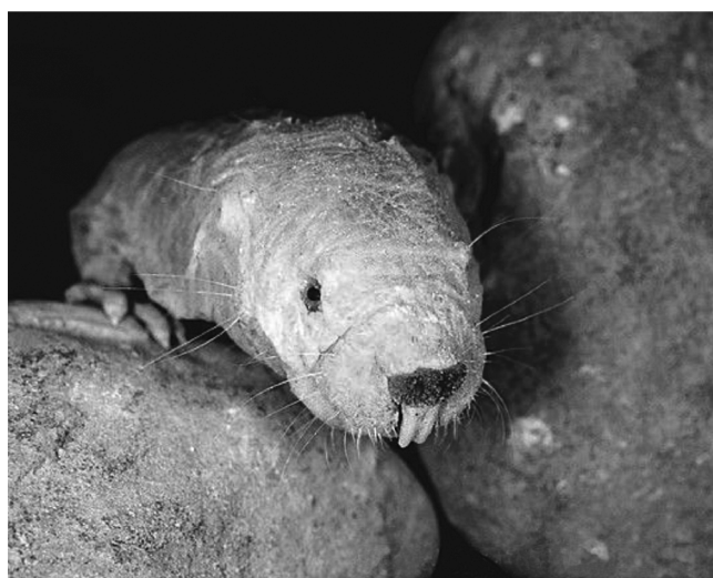
Naked Mole Rat