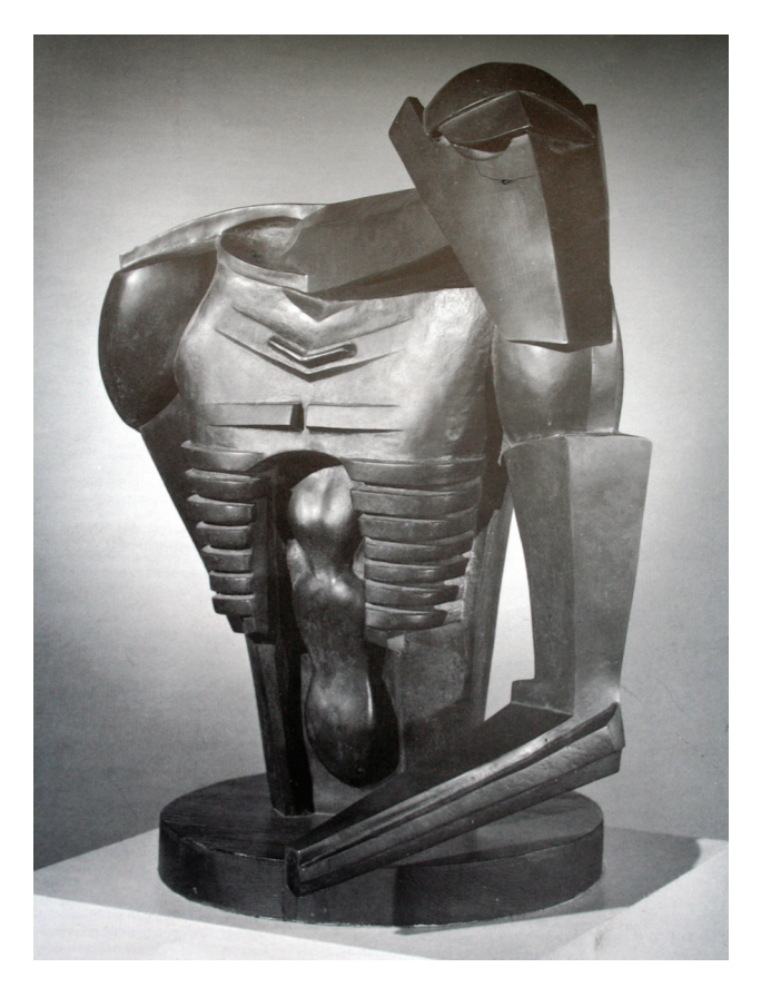
Rock Drill by Jacob Epstein 1914 Cast bronze, Tate Gallery, London