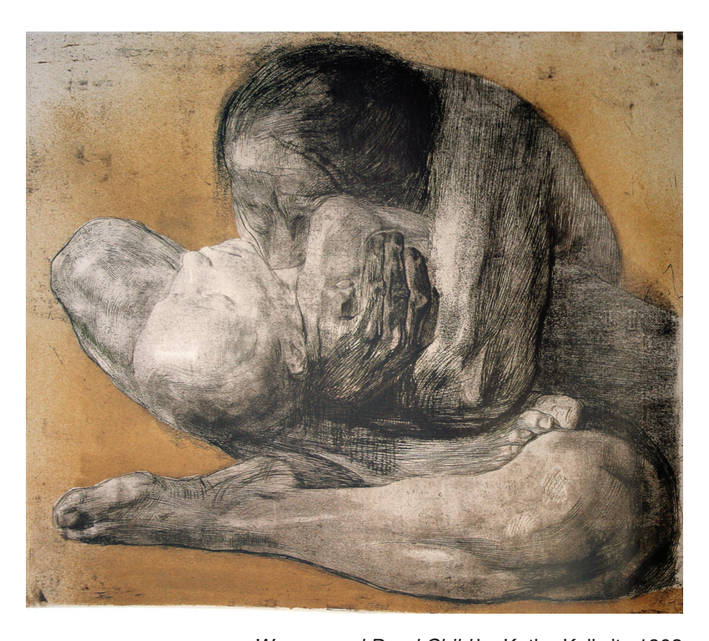
Woman and Dead Child by Kathe Kollwitz 1903 Soft ground etching. Trustees of the British Museum, London.