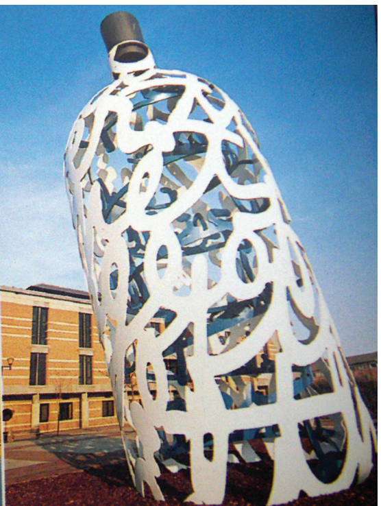
Bottle of Notes by Claes Oldenburg 1993 Cut, welded and painted steel. Middlesbrough.