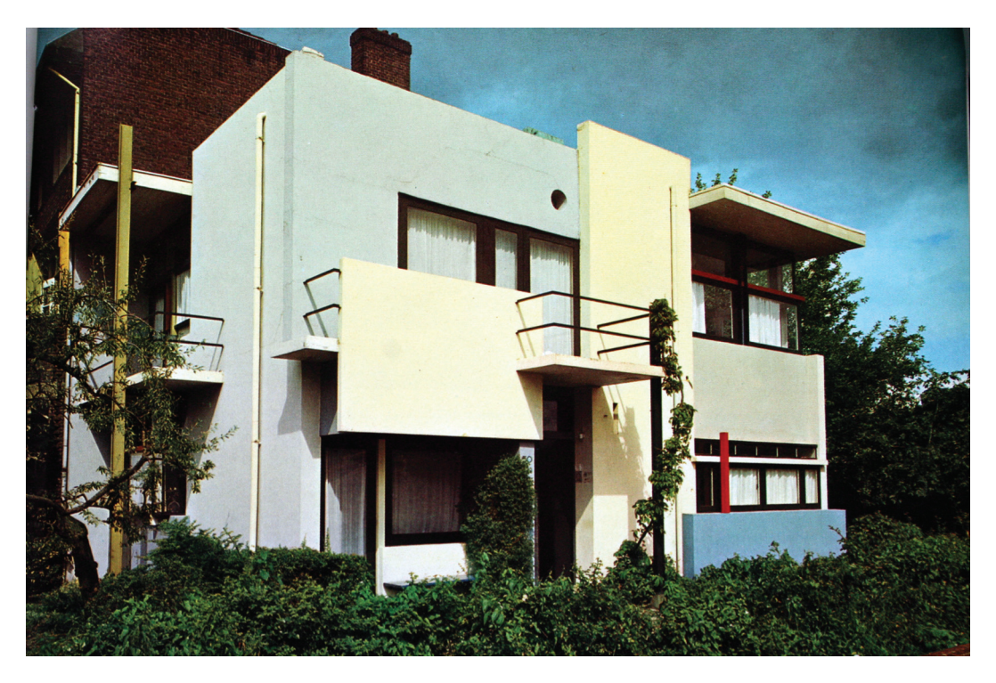
The Schröeder House by Gerrit Thomas Rietveld 1924 Utrecht, Holland