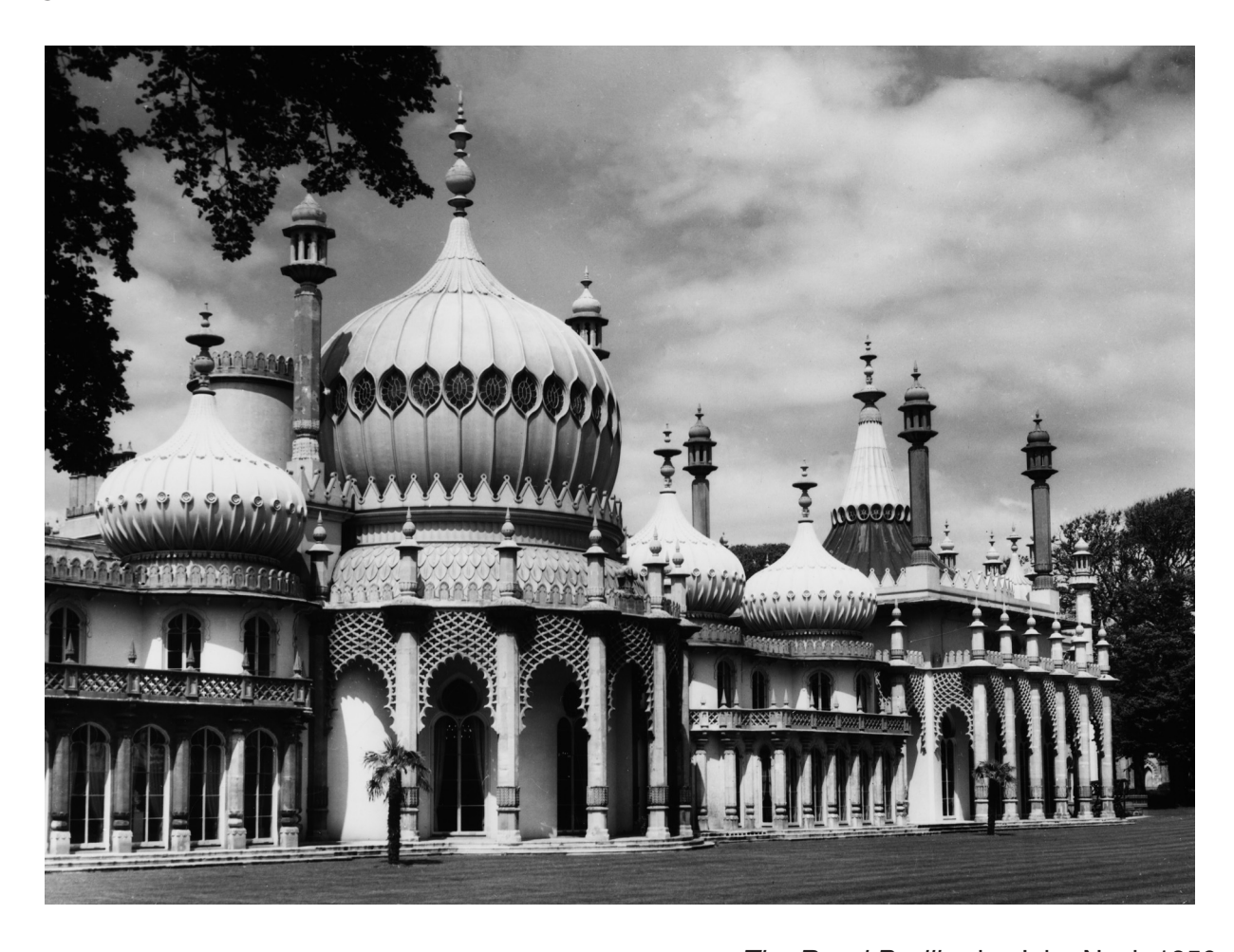
The Royal Pavilion by John Nash 1950 Brighton