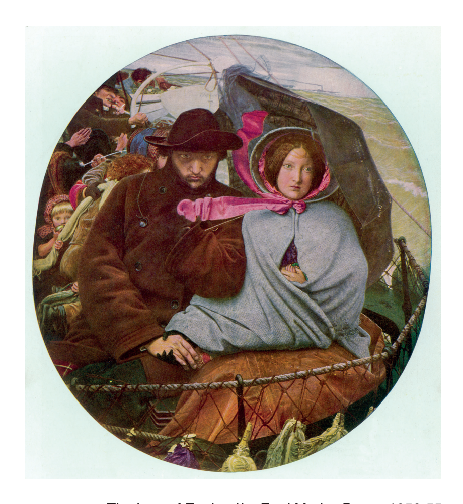
The Last of England by Ford Madox Brown 1852-55 Oil on panel, 82 × 75 cm Birmingham Museum and Art Gallery