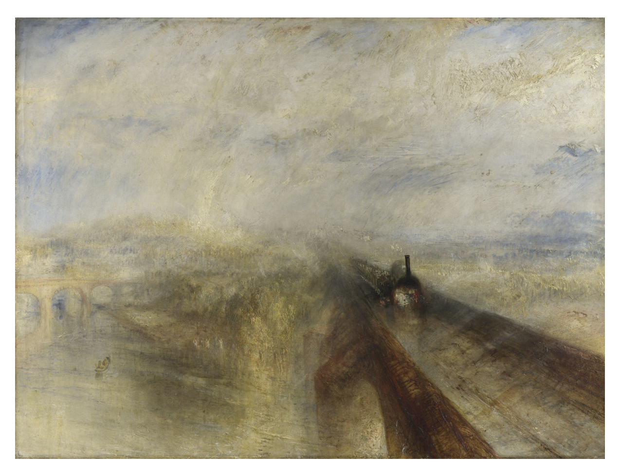
Rain Steam and Speed by J.M.W. Turner before 1844 Oil on canvas 91 \times 122 cm, The National Gallery, London.