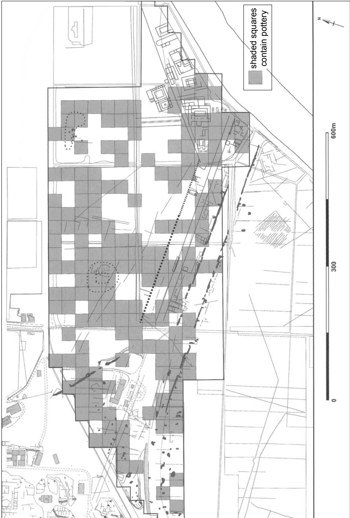
Figure 3 Diagram showing the distribution of Middle Imperial pottery (c AD 100-300) in the fields around the site