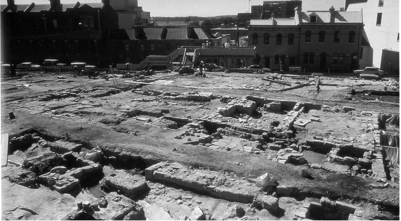
Figure 5 Members of the local community excavating at the Cumberland Street/ Gloucester Street site