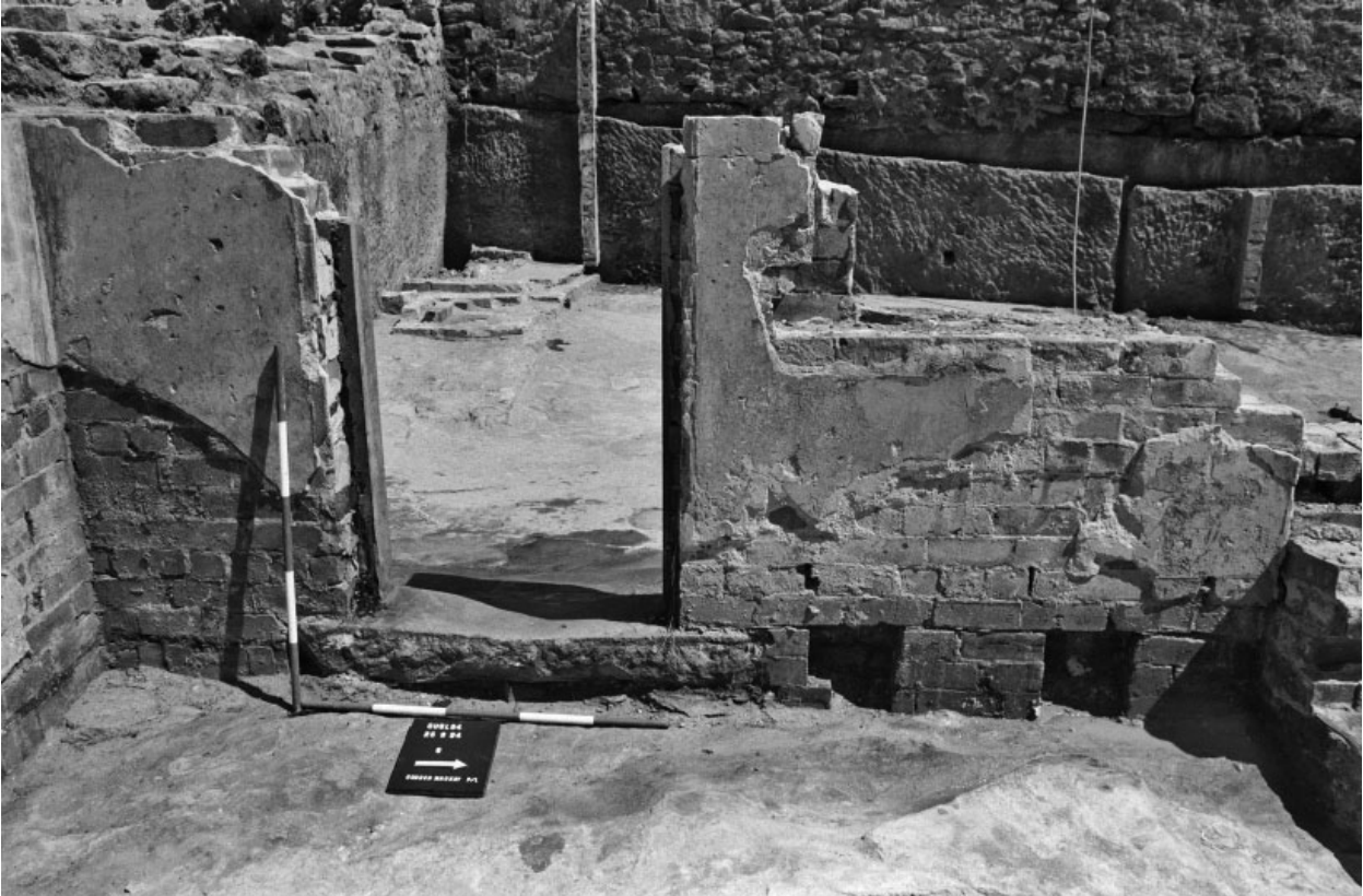
Figure 6(a) Backroom, doorway and yard of 93 Gloucester Street under excavation