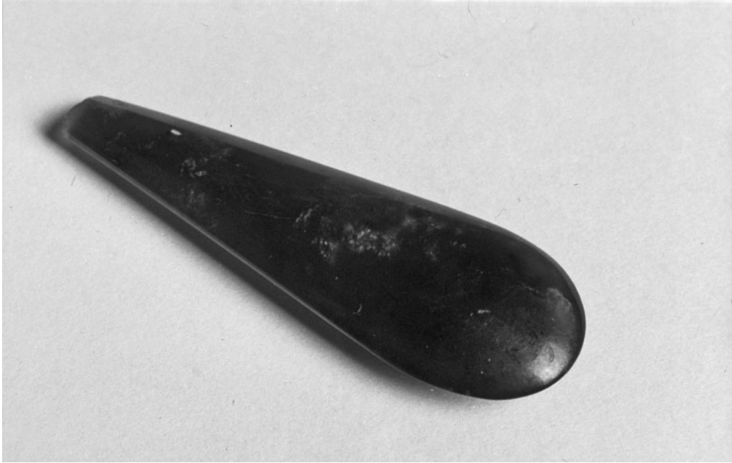
Figure 9 Greenstone ornament found on site, probably a small imported Maori earring from New Zealand