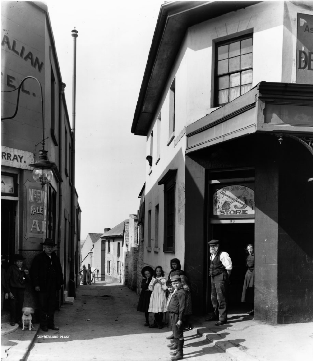
Figure 3 Photograph of Cumberland Place which connects Cumberland Street and Gloucester Street in 1901