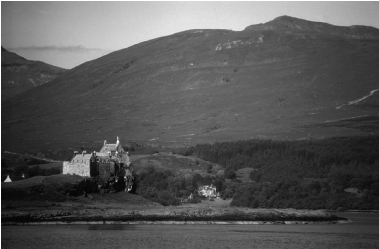
Figure 1: Duart Castle on the Isle of Mull.

Concreted – a hard mass of corrosion formed around some types of metals when they are in seawater.