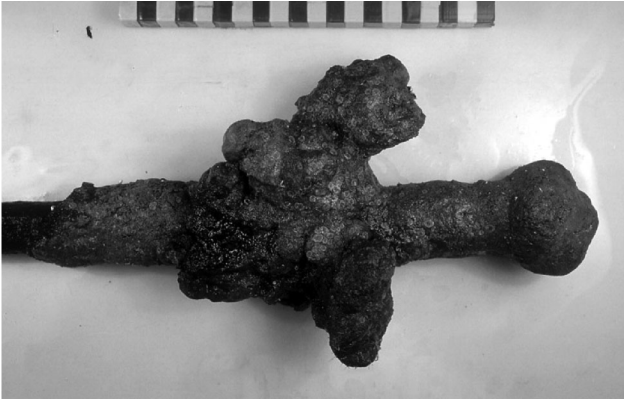
Figure 7(b): Concreted lump from figure 7(a) after conservation. Gold and silver wire has been wound around an iron bar to form the hilt of a sword.