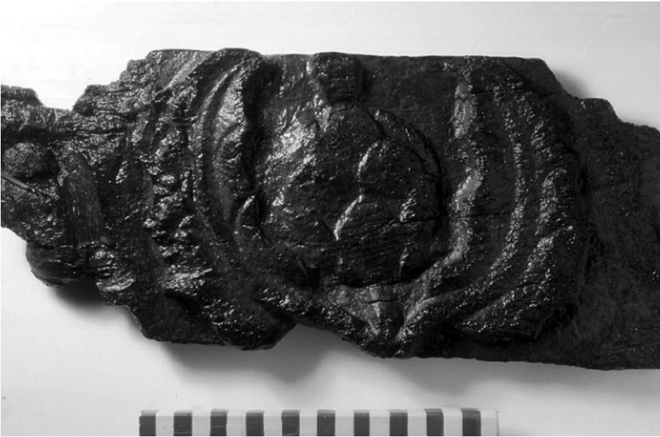
Figure 5(b): Photograph of the carving of the harp of Ireland from the wreck of the Swan (scale shows centimetre intervals).