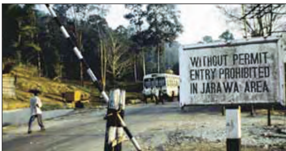
ATR board at Jirkatang