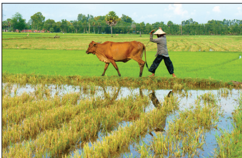
Rice fields in the countryside