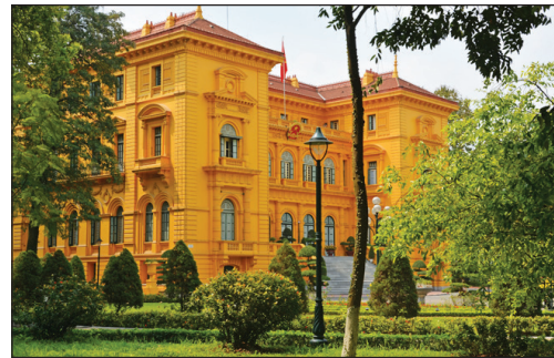
French colonial architecture