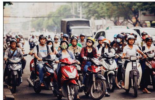
Daily traffic in Vietnam's cities