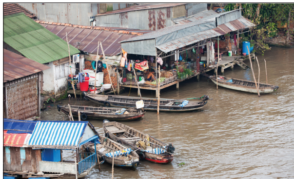
Community life along the Mekong

Many Vietnamese people support their government's aims and objectives for its tourism industry as they believe it will improve their quality of life. However, some Vietnamese communities and international pressure groups are concerned about the negative impacts of tourism development within the country. In particular, there are social and environmental concerns regarding the Mekong River Delta and Halong Bay and their local communities. An example of this is increasing exploitation of local communities by international tourism companies.