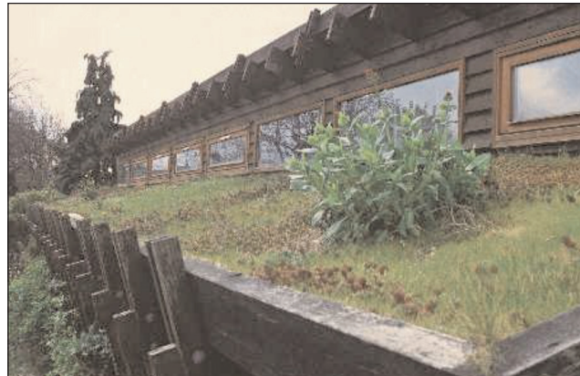
An insulated grassed roof

The NNPA and YHA have consulted local communities and many organisations in the planning of the Sill Project, including: