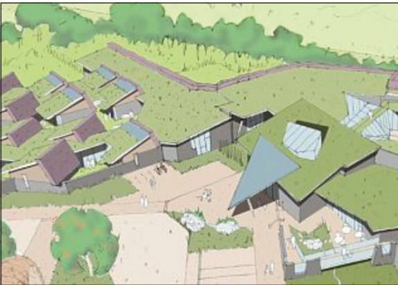
Artist's impression of the Sill Project

The Sill will be built from local materials including different types of stone and timber sourced from across the National Park. The project will provide training opportunities for local businesses during the development phase. Solar panels and an insulating grassed roof on the building will help to reduce energy costs.