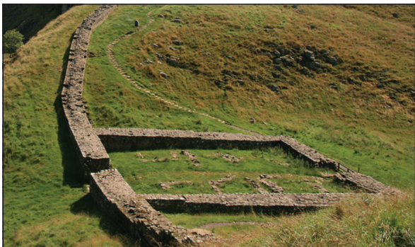
A section of Hadrian's Wall

Northumberland also has its own National Park which covers approximately 400 square miles of protected landscape with breathtaking views, crystal clear streams and rich wildlife havens. The National Park is free for everyone to enjoy and includes Hadrian's Wall, a UNESCO World Heritage Site. The National Park also includes the picturesque valley of the North Tyne river and the Cheviot Hills.