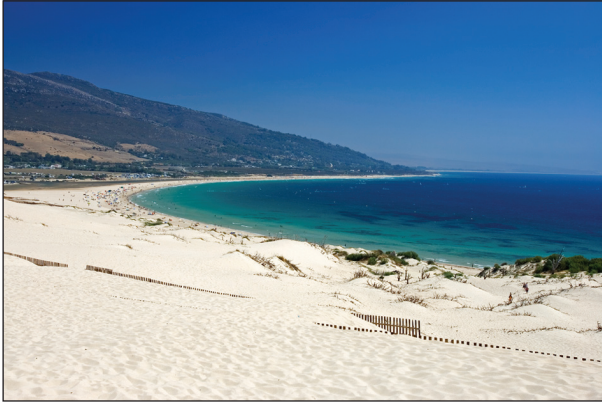
Valdevaqueros Beach, Tarifa