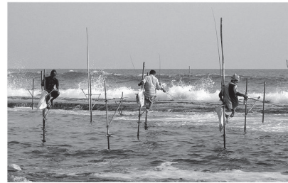
Stilt fishermen of Sri Lanka