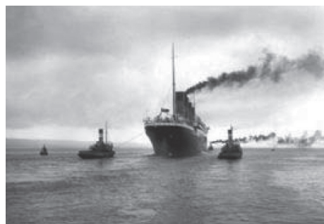
RMS Titanic sailing from Belfast

Spread over six floors there are nine galleries, each gallery focuses on a part of the Titanic story including social history and engineering advances. Factual information is brought to life through scale replicas, interactive displays and artefacts. Visitors can learn about 100 years of ship-building and ocean exploration.