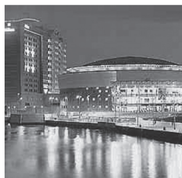
Belfast Waterfront convention centre

Following major efforts over the past decade to revitalise the city's tourist offering, Belfast has become a popular short-break destination. With Belfast Waterfront convention centre and five star accommodation, such as the Merchants Hotel, it is now also recognised as a world class business and conference destination.