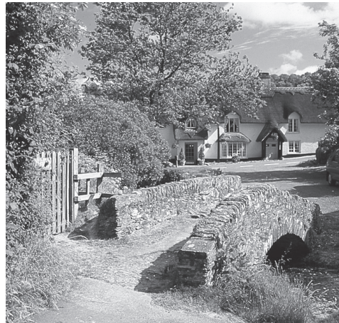
Beautiful Exmoor village

The new hotels will range in size from 30 to 100 bedrooms, depending on the location and building requirements.