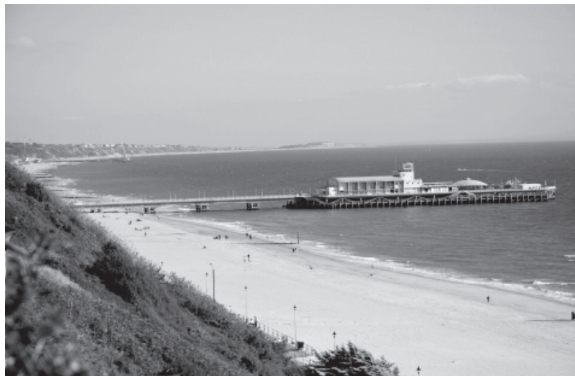
Bournemouth beach and pier