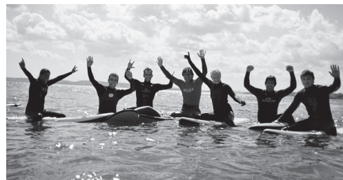
Bournemouth Surf Club