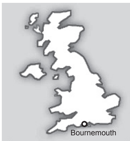
Location of Bournemouth

Bournemouth is situated along the south coast of England in the county of Dorset. With its mild climate and seven miles of golden sands, Bournemouth has attracted tourists since the early 1800s. Its growth as a seaside resort resulted from the popularity of the health giving benefits of sea water and sea air and also its spa waters. In 1870 the railway arrived, linking Bournemouth to London and in 1885 the first spa hotel was built.