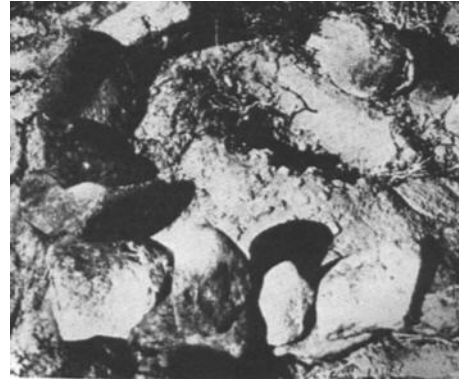
One of the four impressions found at the Socorro site.