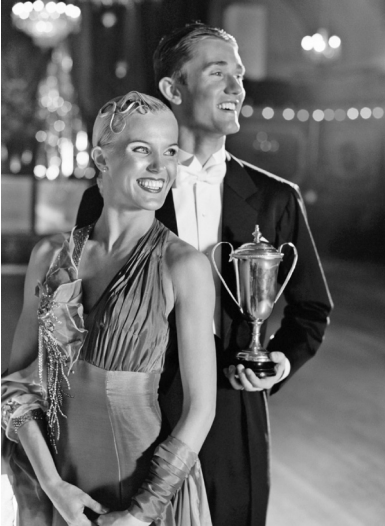
Concurso de baile

Los programas de telerrealidad ¿Son entretenidos o son telebasura?