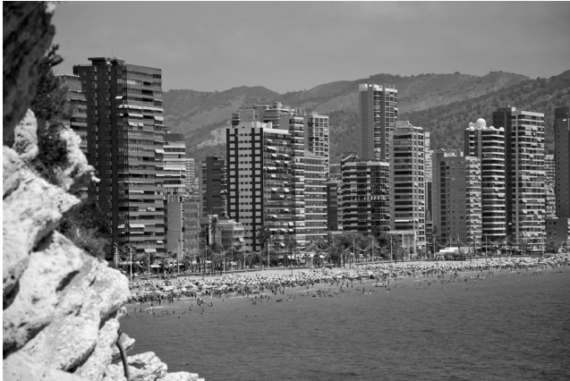
Más construcción hotelera