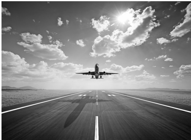
Más tráfico aéreo