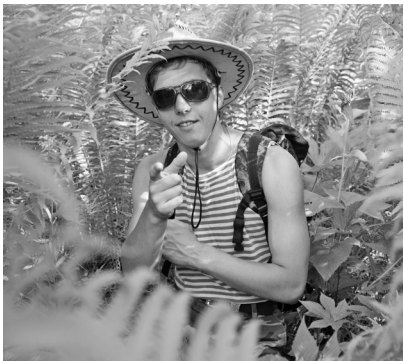
Celebridades en la selva