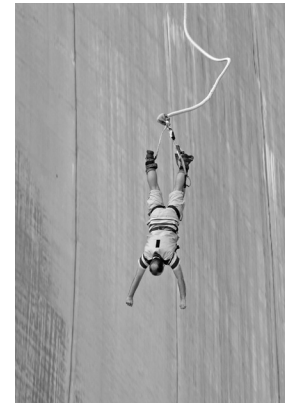
el salto en bungee