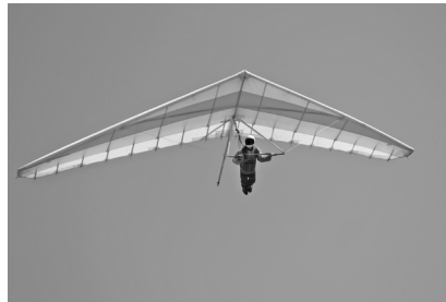
el ala delta