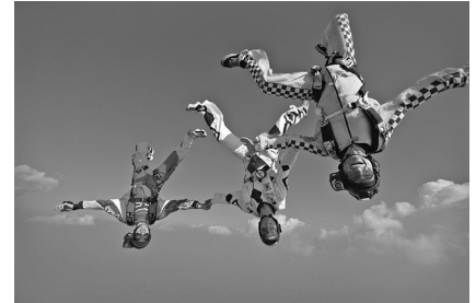
la caída libre