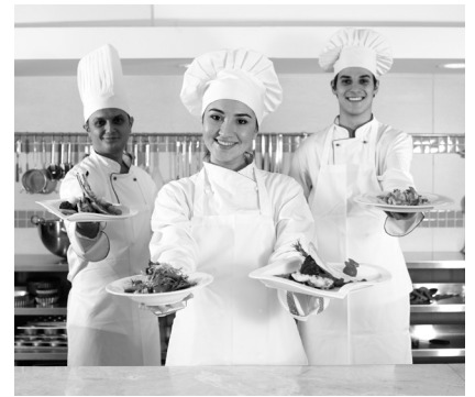
Concurso de cocina