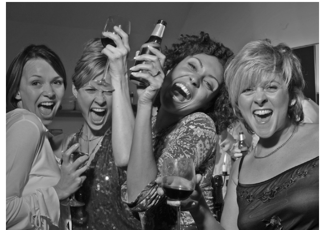
Más consumo de alcohol