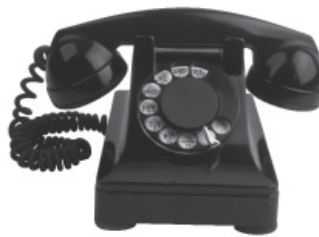
1950 – el teléfono fijo, sólo transmite sonido