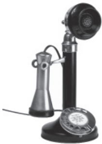
1920 – el teléfono antiguo, un aparato de lujo