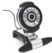
2010 – webcam, transmite imágenes en vivo