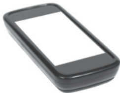
2005 – el teléfono móvil con juegos, cámara, Internet, vídeo...