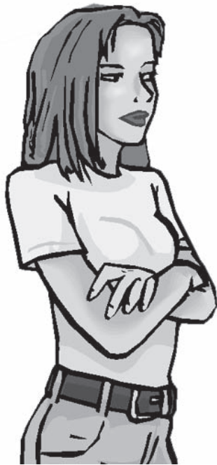
la madre soltera