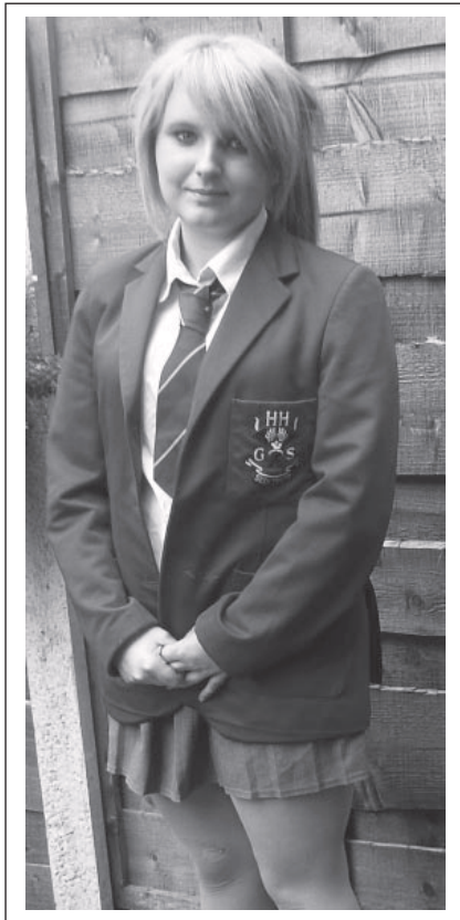
vestida de día