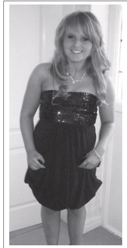
vestida de noche

vestido, maquillaje, zapatos, peinado.... ¿definen la personalidad?