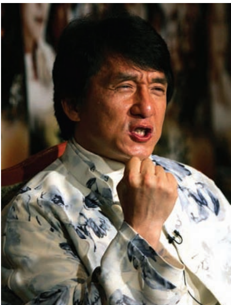
Jackie Chan, actor