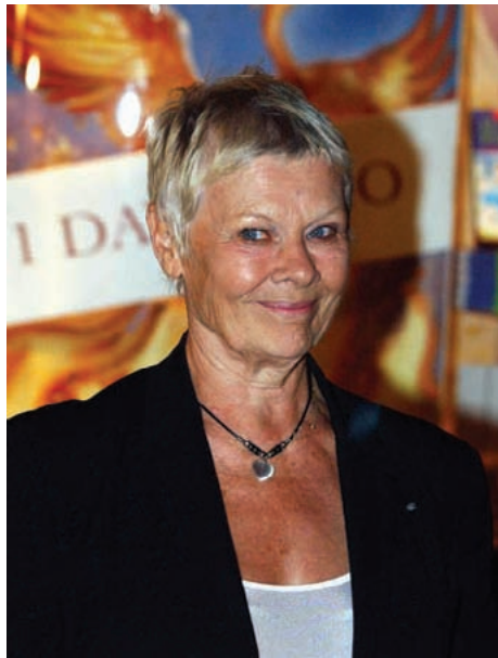
Judi Dench, actor