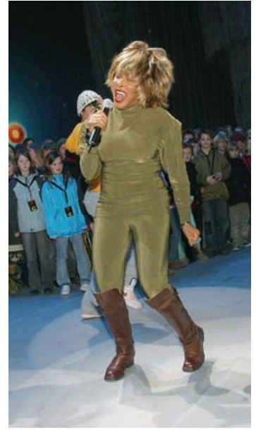
Tina Turner, singer