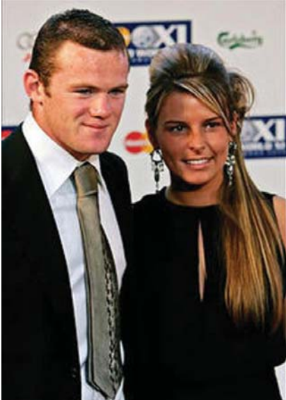
Footballer Wayne Rooney and girlfriend Colleen McLoughlin