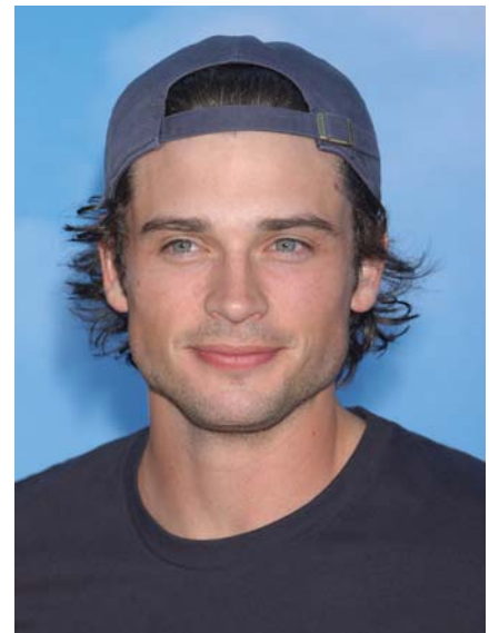
Smallville star Tom Welling