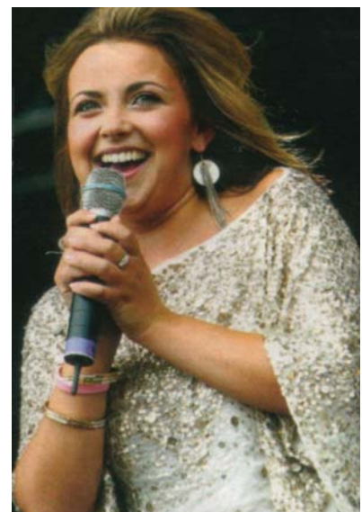
Singer Charlotte Church