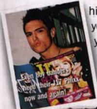
Ewan boy handlers reveal their J17 Phixx now and again!