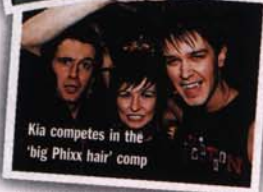
Kia competes in the 'big Phixx hair' comp