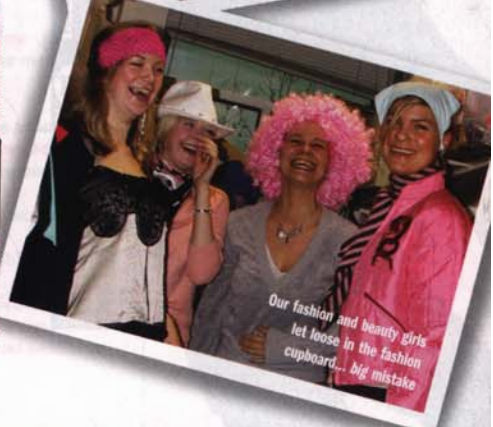
Our fashion and beauty girls let loose in the fashion cupboard... big mistake