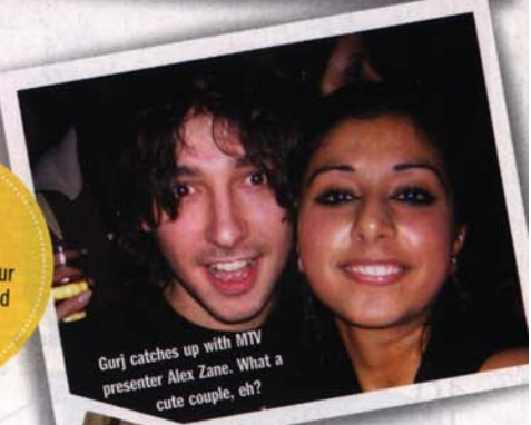
Gurj catches up with MTV presenter Alex Zane. What a cute couple, eh?