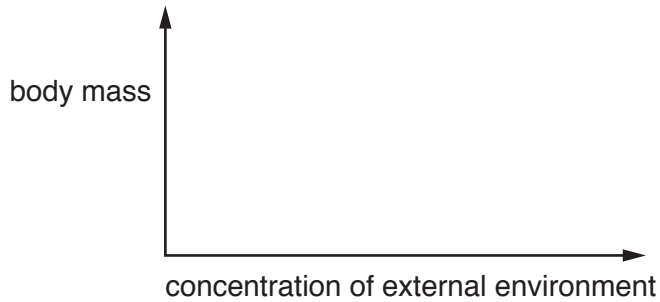
Fig. 3.2 [1]

(iii) On Fig. 3.2, sketch a line to show how the body mass of a mussel would change as the concentration of the external environment changes.