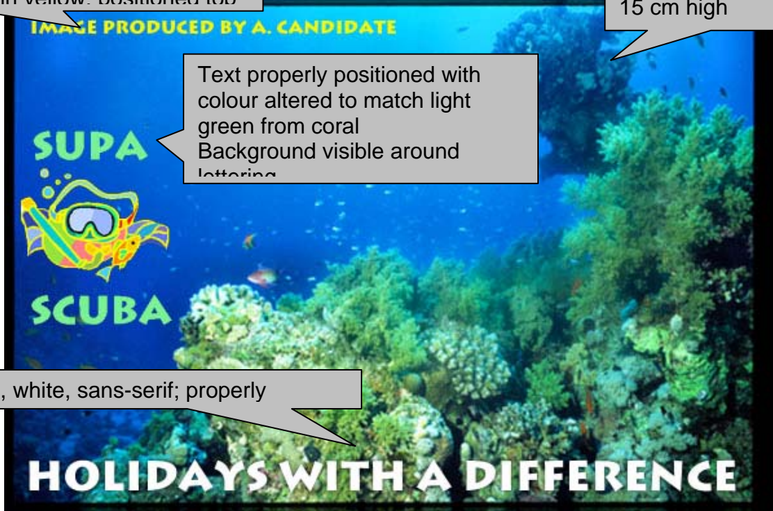
Image is 21 cm wide x 15 cm high

Text properly positioned with colour altered to match light green from coral Background visible around lettering