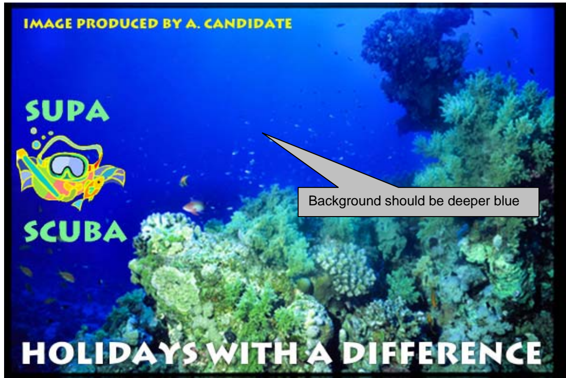
Printout at step 16