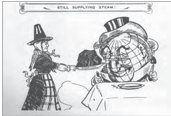
[A cartoon entitled Wales presenting her coal to the world , from Punch , a satirical magazine (1905)]