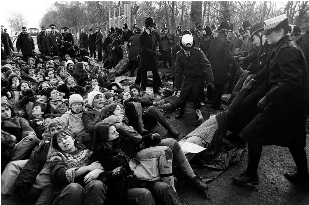
A photograph of police and protesters at the Greenham Common Peace Camp, 1982.

Source 7: A photograph of protests at Greenham Common.