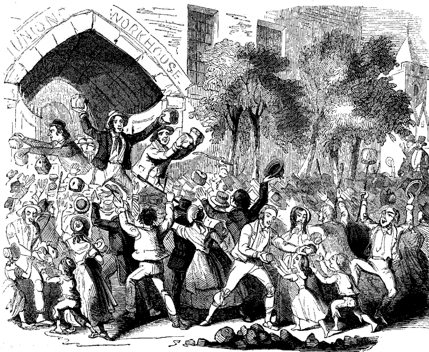
From the 'Illustrated London News', 1842.