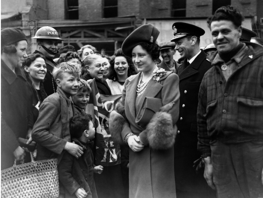
A photograph of the King and Queen visiting survivors of the Blitz in East London, 1940.

Source 5: A royal visit during the Blitz.