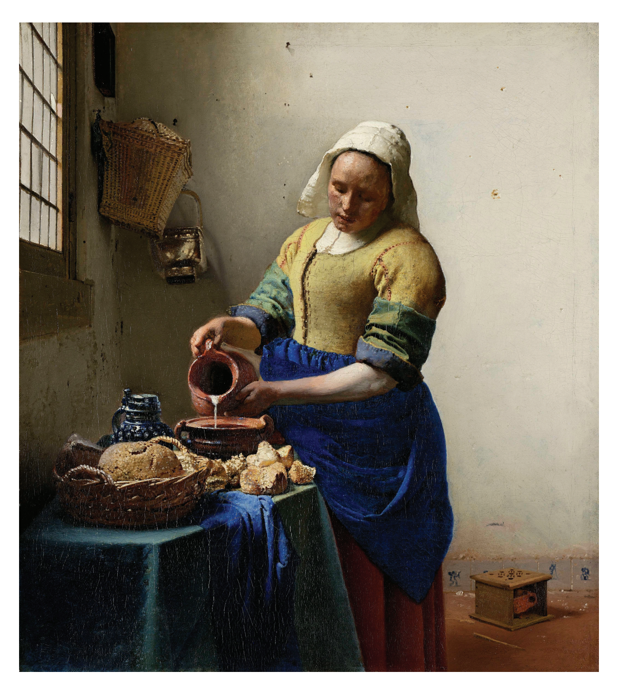
Figure 1: Johannes Vermeer, The Milkmaid , c.1660, oil on canvas, 45.5cm x 41cm (Rijksmuseum, Amsterdam)