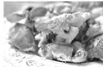
traditionelles Essen aus der Region