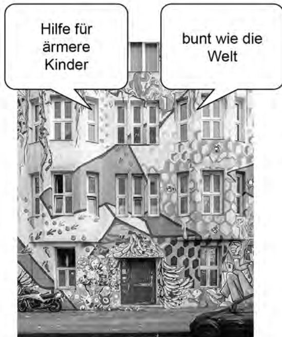
Das Kunsthaus von KRASS in Düsseldorf