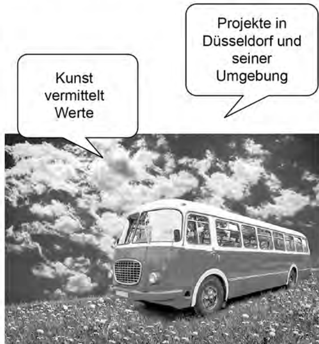
Mit dem Kunstbus unterwegs in der Region