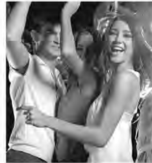
....umgebaut zu einer Disko mit