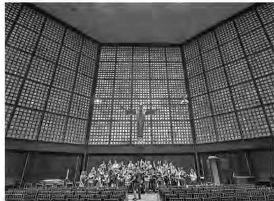
Kaiser-Wilhelm-Gedächtniskirche am Breitscheidplatz

Teilnehmer von 100 Religionsgemeinschaften in Berlin