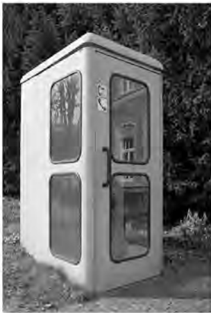
Eine alte Telefonzelle.....

Seit vier Jahren gibt es in Berlin an zwei Standorten eine ‚Teledisko‘ – die kleinste Diskothek der Welt.