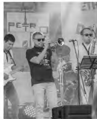
Live-Musik mit Jazz-Gruppen