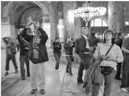
Besucher in der Berliner Moschee