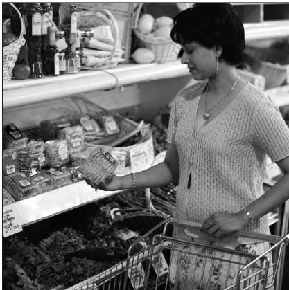
Einkaufen im Bio-Laden

Immer mehr Deutsche kaufen regelmäßig Lebensmittel aus ökologischer Produktion.