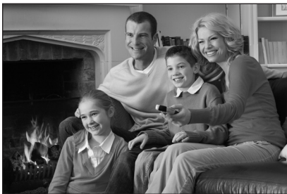
Gemeinsam Sendungen ansehen