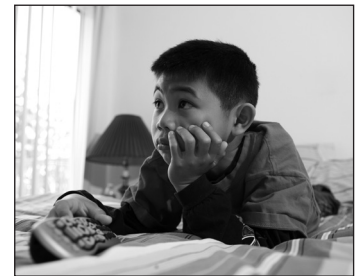
Fernseher im Kinderzimmer