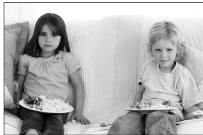
Essen vor dem Fernseher