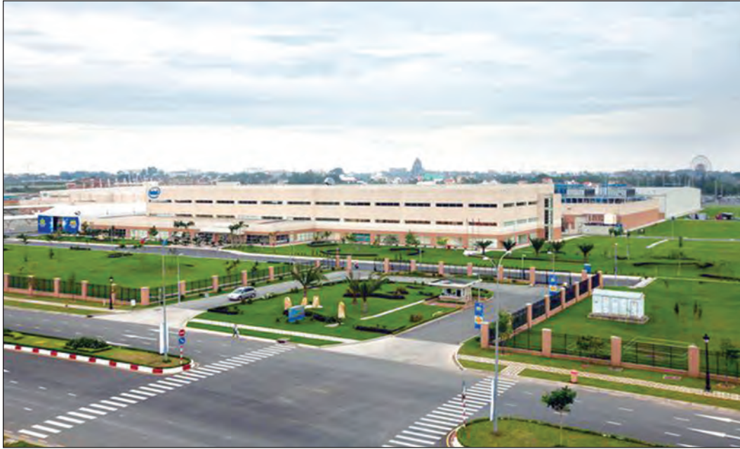
Photograph 5 – A new MNC factory in Ho Chi Minh City