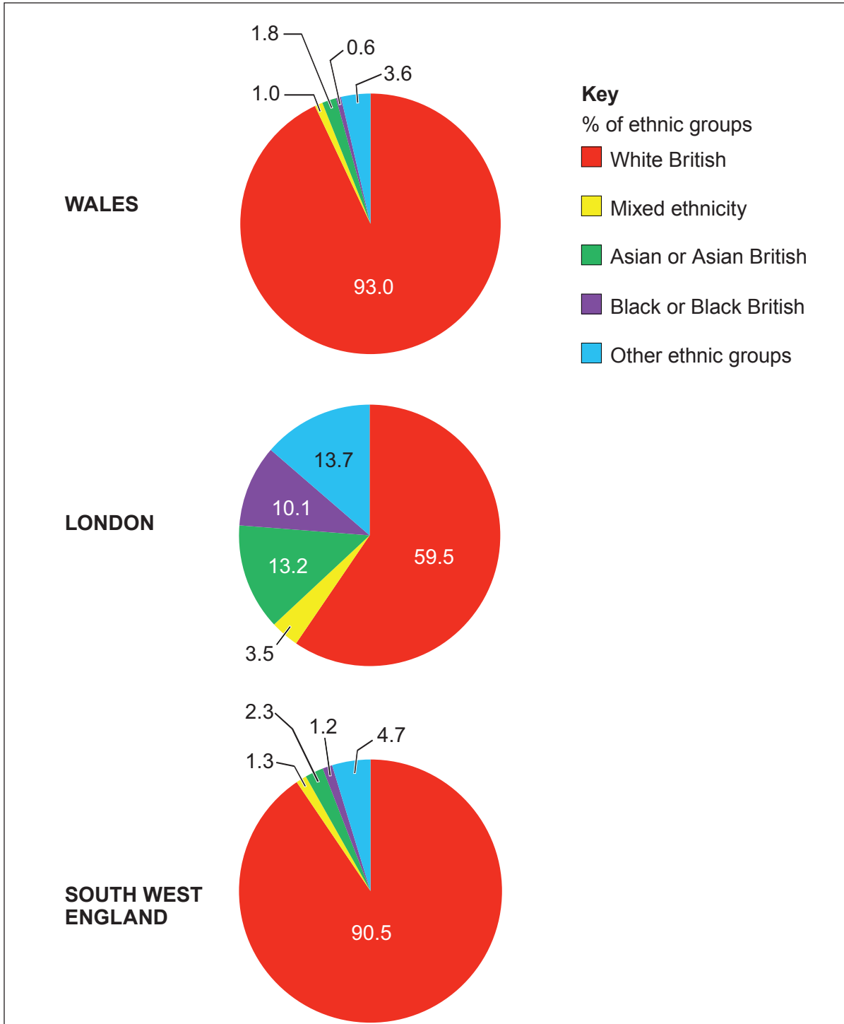
Figure 1: Percentage of ethnic groups in selected areas of the UK, 2009