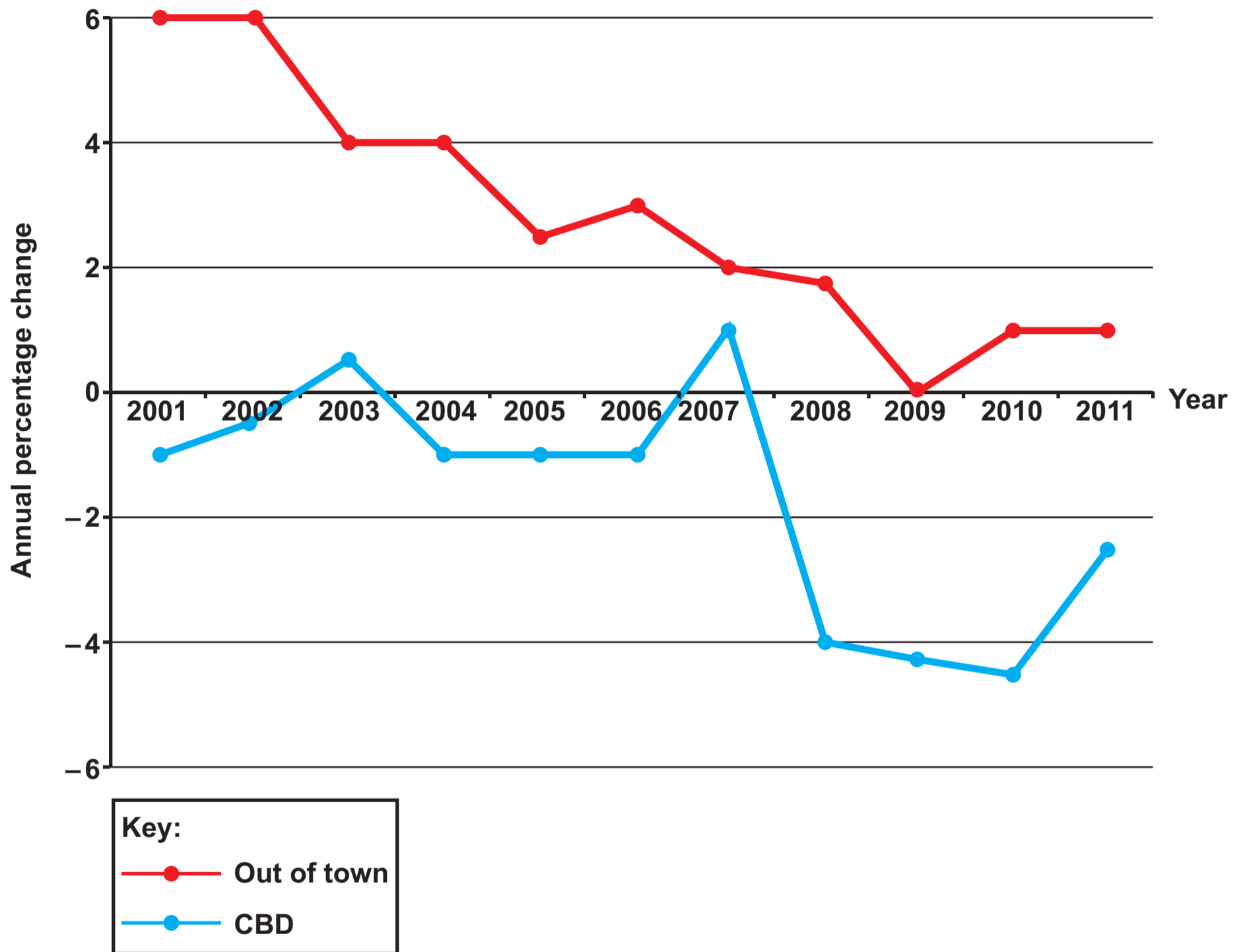
FIGURE 2: Annual percentage change in retail space in use in the UK, 2001-2011

Source: adapted from The Portas Review An independent review into the future of our high streets, December 2011