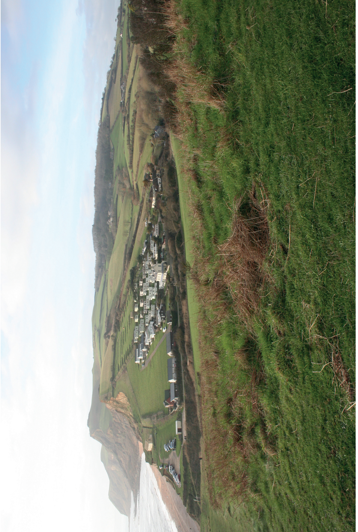
Fig. 2 A photograph of an area where an A Level geographical investigation is to be undertaken