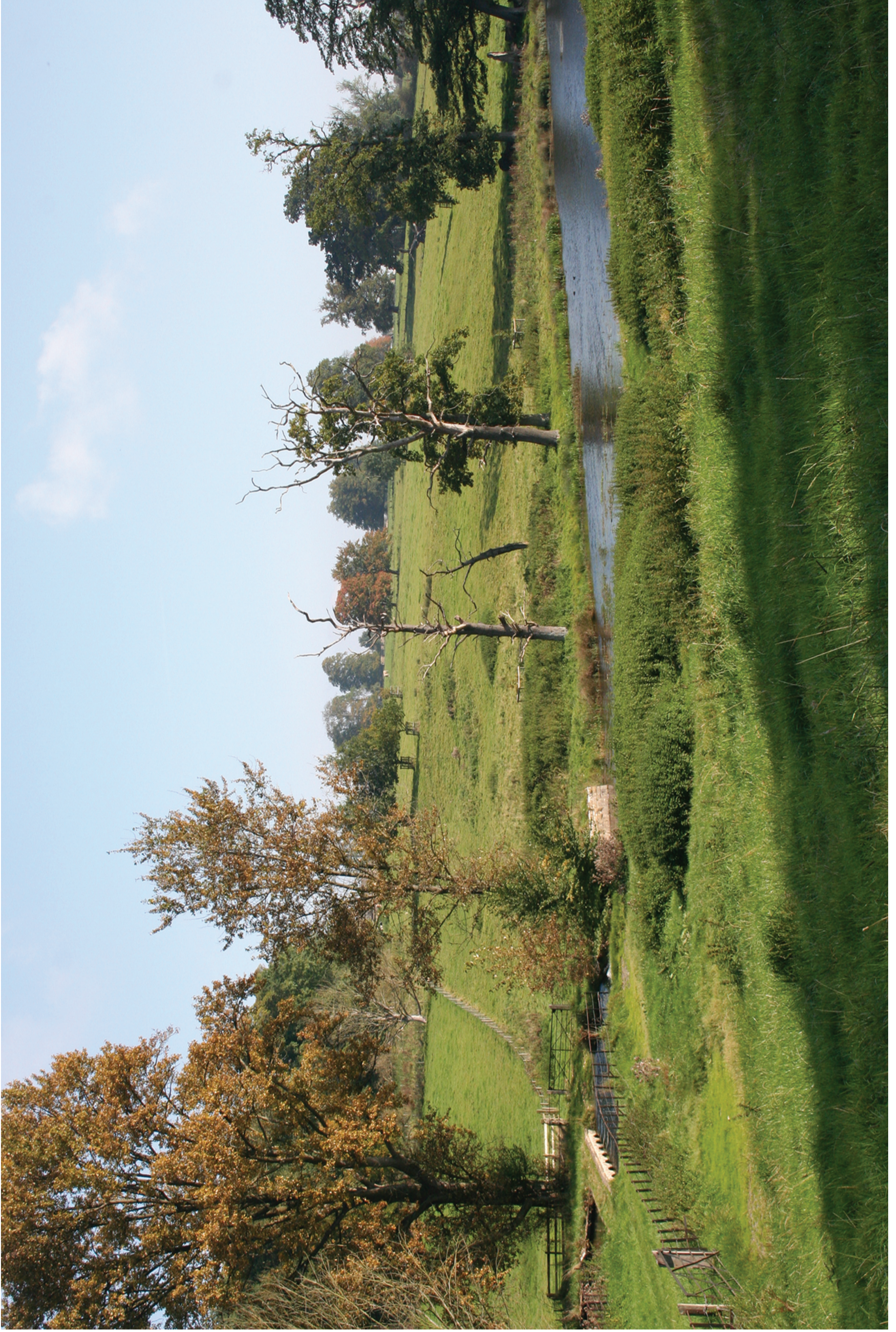
Fig. 1 Photograph of an area in which a geographical investigation is to be undertaken