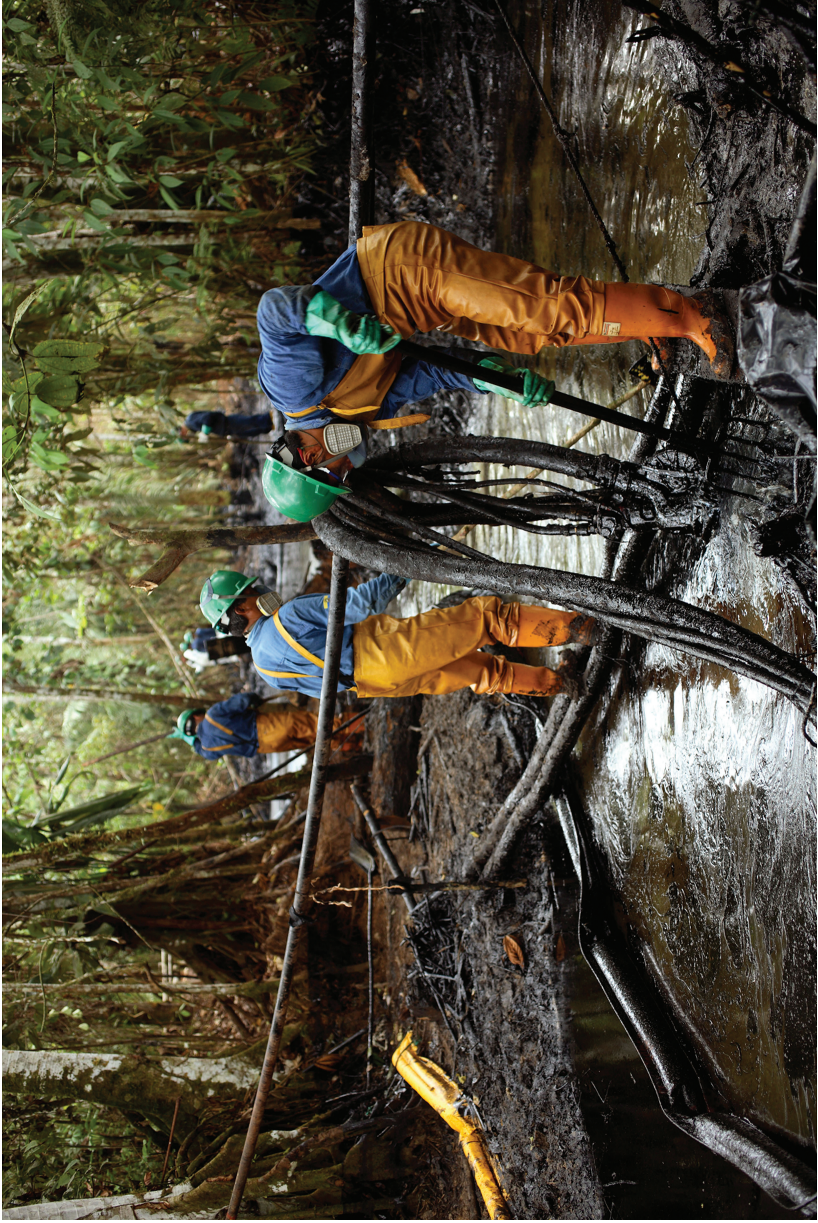
AN OIL SPILL IN PART OF THE AMAZON BASIN, ECUADOR