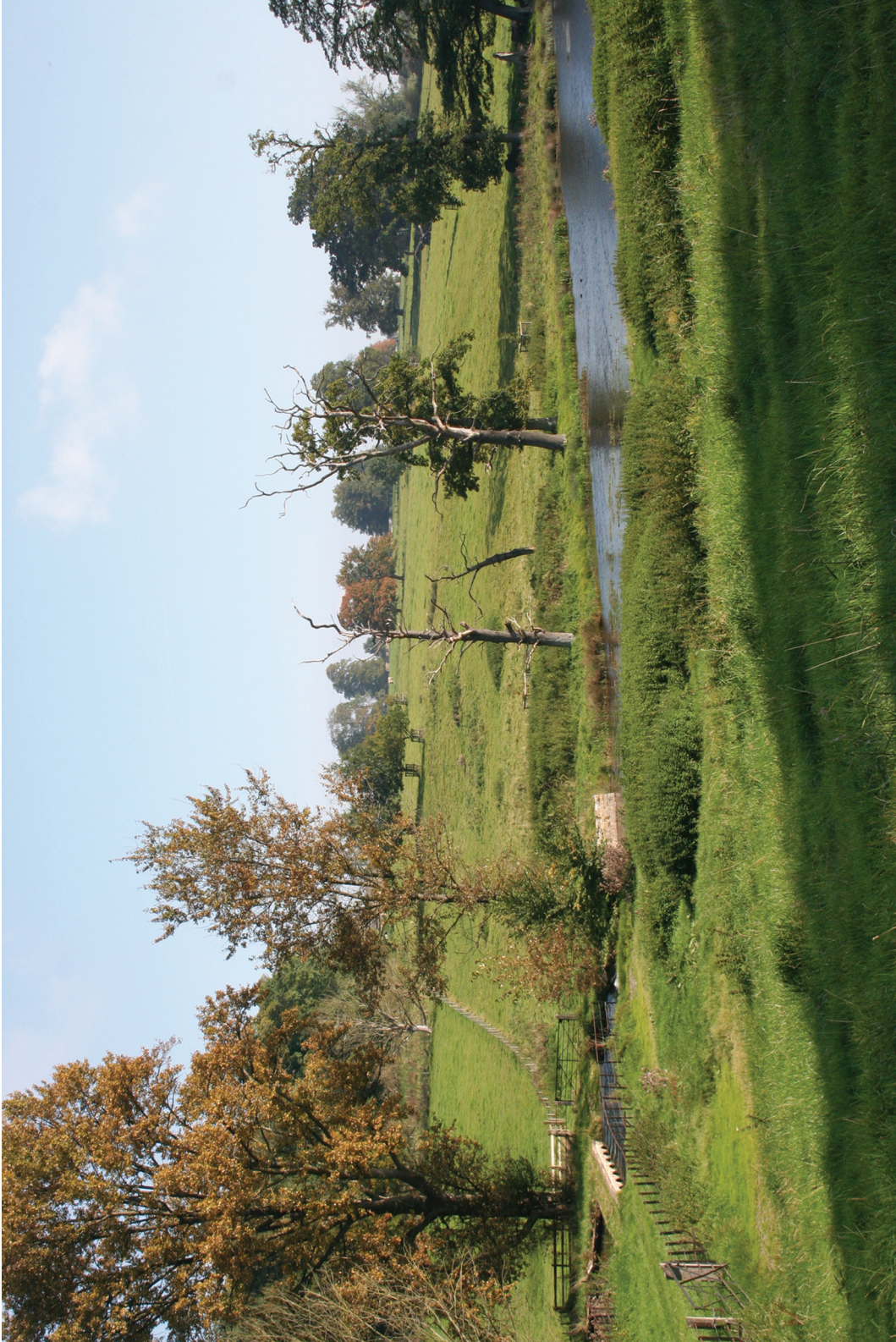
Fig. 1 Photograph of an area in which a geographical investigation is to be undertaken