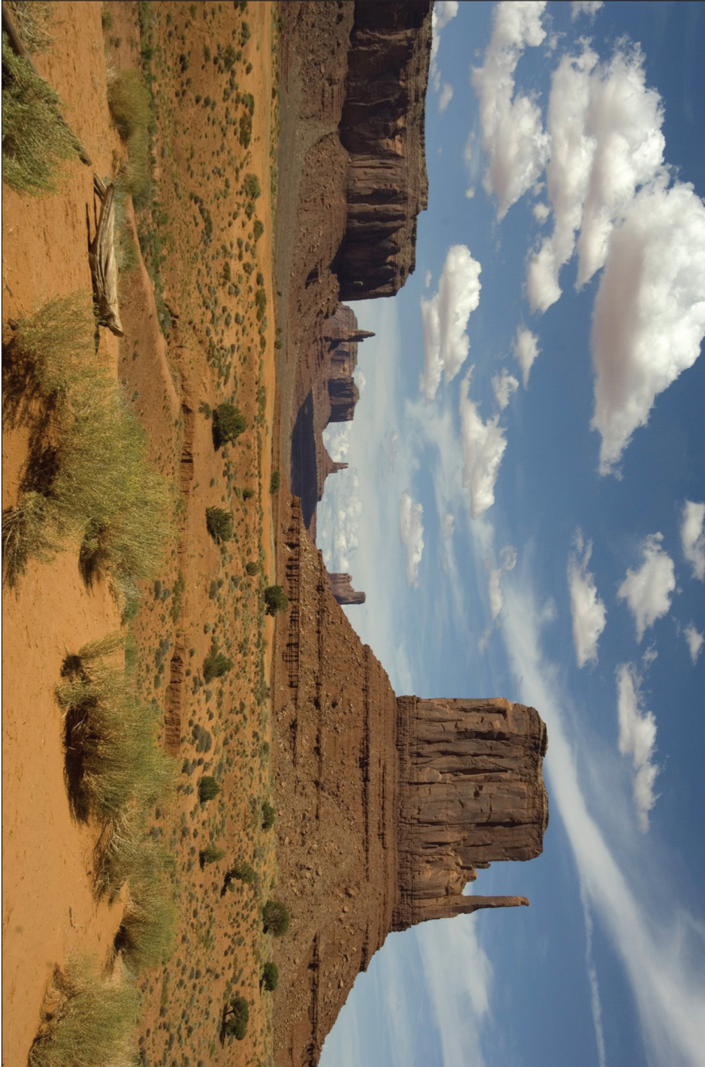
Fig. 3 Monument Valley, Utah, U.S.A.