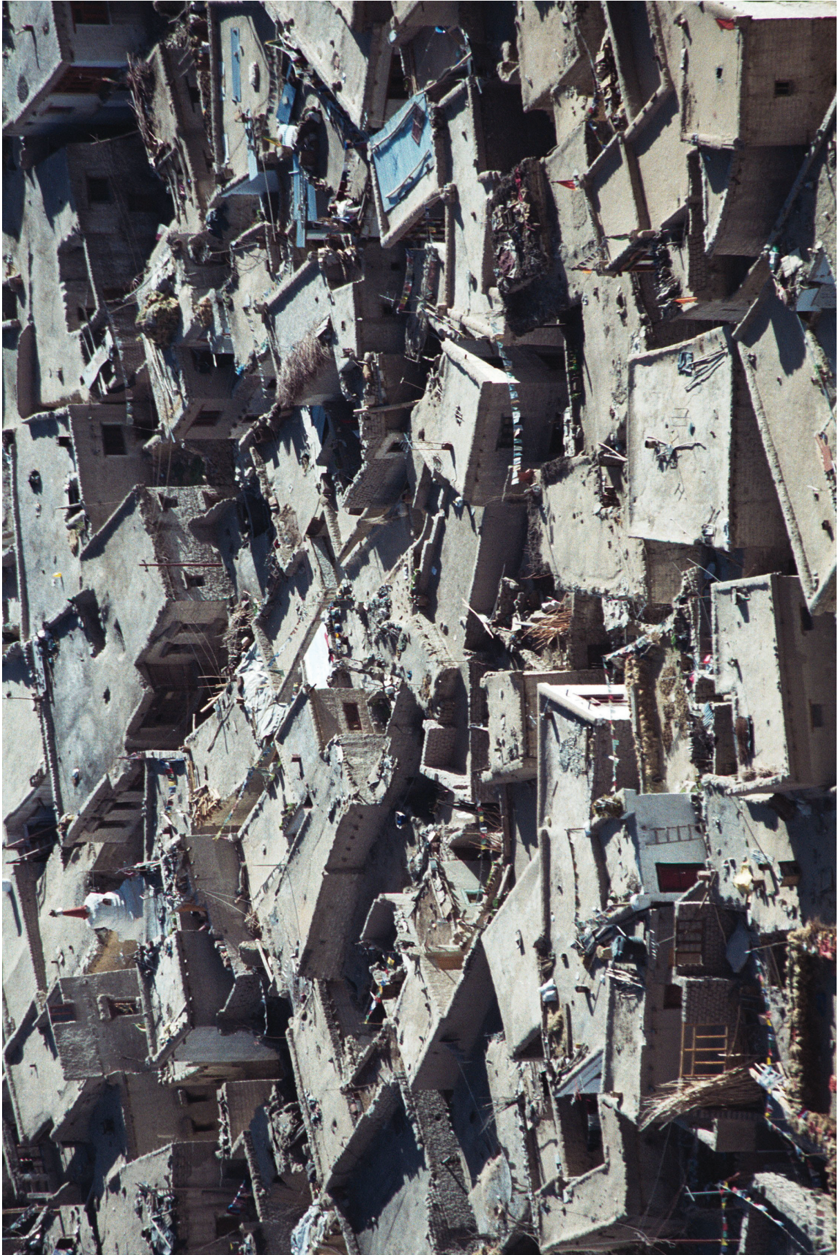
FIG. 1 AN URBAN AREA IN INDIA