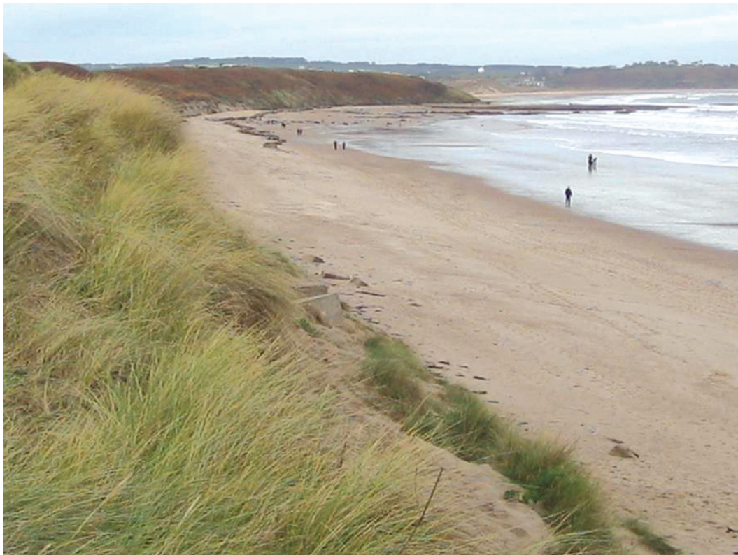
Fig. 2 Coastal location