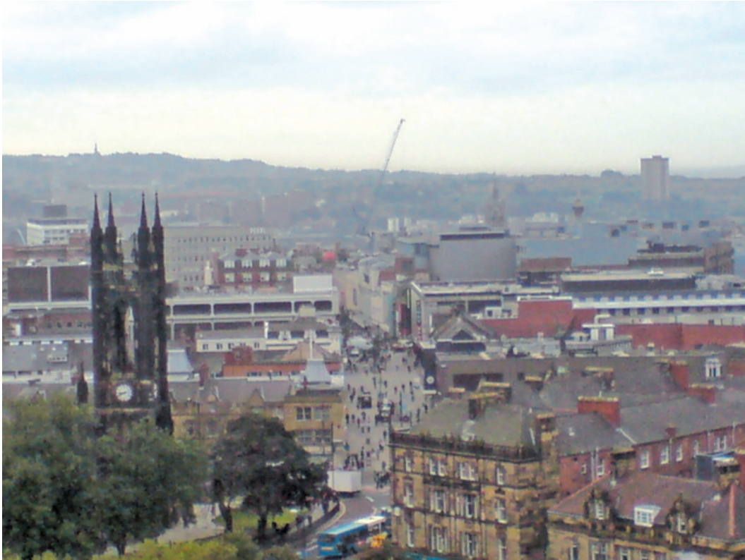
Fig. 1 Urban location