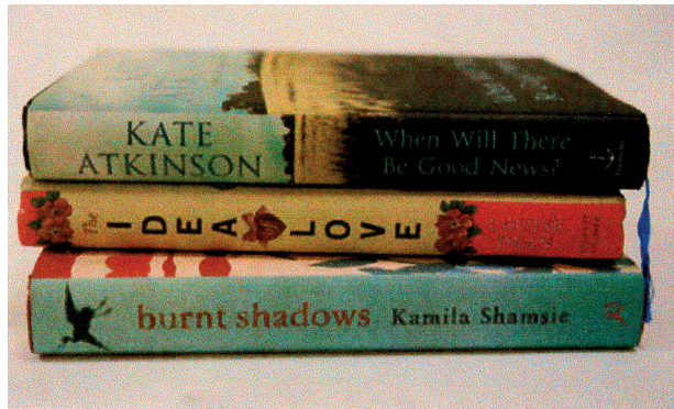
The hardback novel: surprisingly resilient.

Can it be good news or bad news that the six Booker prize contenders have already sold a record 37,500 copies, some 127% more than 2010's chosen sextet managed last year? Bad news, sniff some, because high-minded quality ought to come first. Good news, say bookstore owners, beaming all the way to the bank and getting ready for a Jamie Oliver Christmas bonanza. But maybe the crispest conclusion is simply that this is fascinating news. Because the last time I looked, traditional books, involving words printed on paper, were supposed to be dying as the tornado of digital destruction swept on. 5