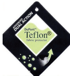
Label attached to skirt A