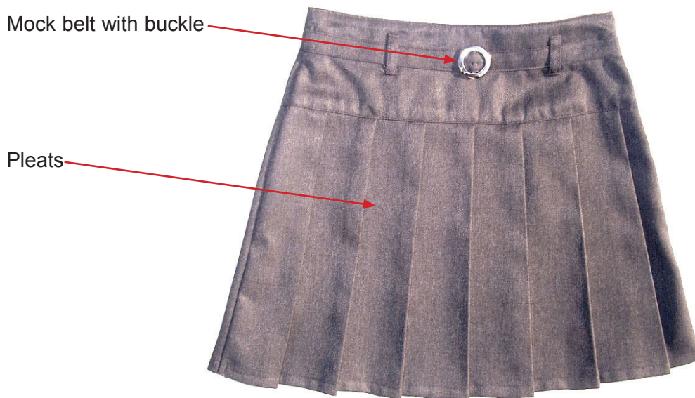
Skirt A – Front View