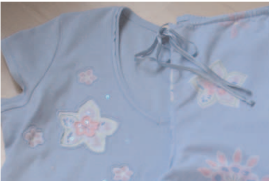
Close-up view of Style A pyjamas

Cotton jersey top. Printed woven cotton bottoms have adjustable elasticated waistband.